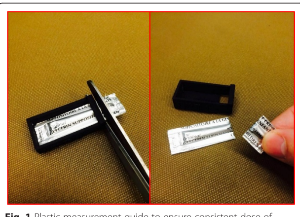
Fig. 1 Plastic measurement guide to ensure consistent dose of glycerin suppositories

All study interventions will be administered by one of the NICU charge nurses on duty. These individuals have years of experience working in the NICU but are not involved in the care of individual patients. All participants will receive a medical order of "nil per rectum" during the period of study treatments. This will be removed once study treatments stop. Study participants will be eligible